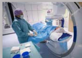
20" Flat Detector

Azurion is the new-generation Image Guided Therapy platform that provides a foundation for today and the innovations of tomorrow. It is backed by innovative services and support that offer a lifetime of benefits, reinforcing our commitment to you and your patients.