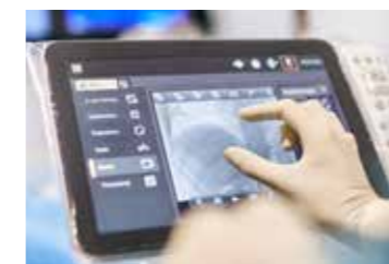
Touch screen module Pro

91% believe that the system will help reduce procedure time 1