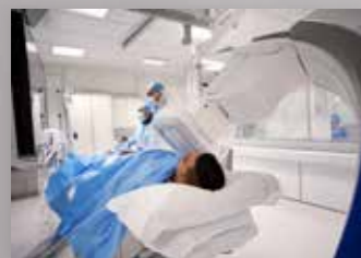
12" Flat Detector