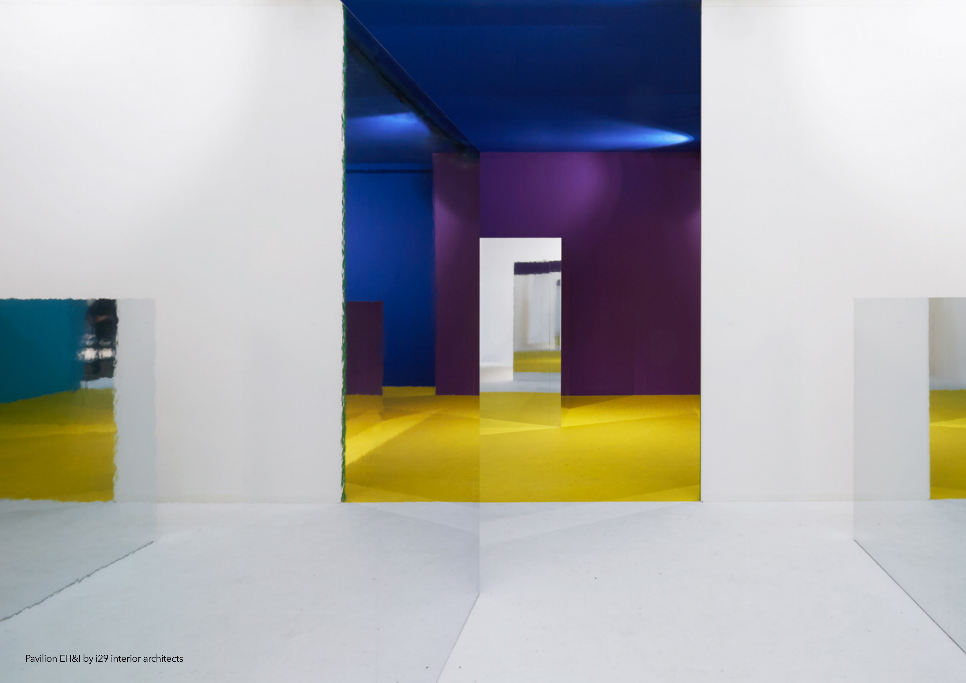
Pavilion EH&I by i29 interior architects