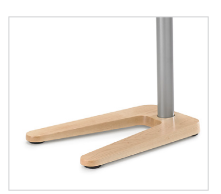
Mobile Table with offset base