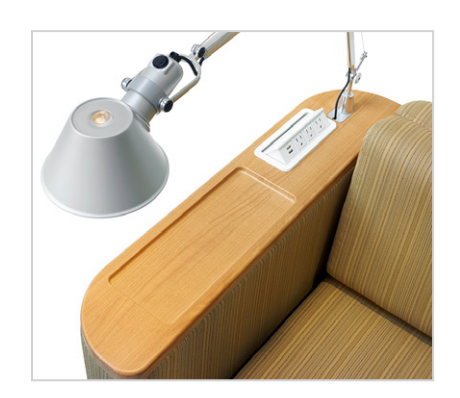
Utility arm with optional power, USB, and lighting