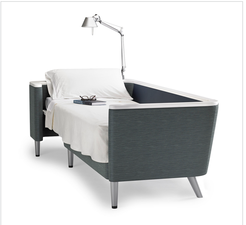
Flop Sofa, sleep position