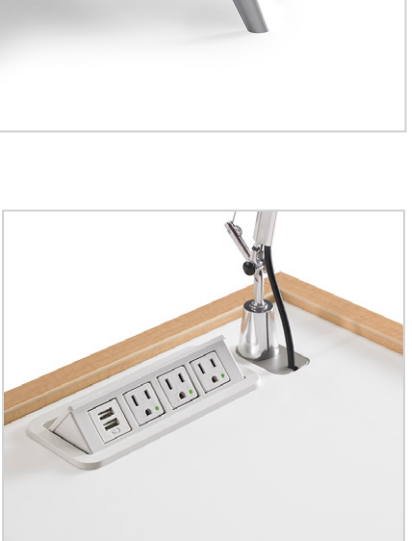
Tote with optional power, USB, and lighting