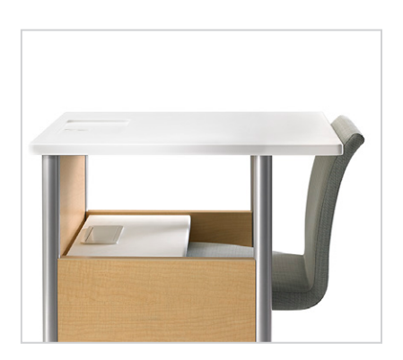
Daystand with Stool