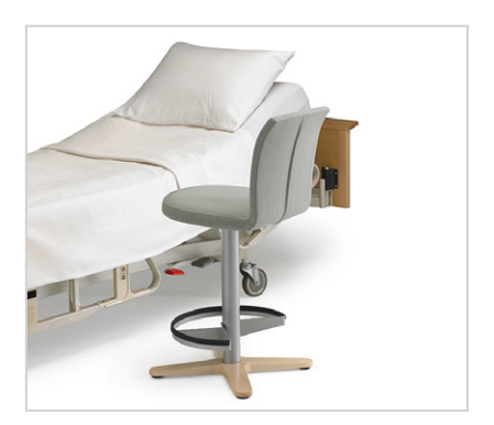
Stool shape supports natural swiveling