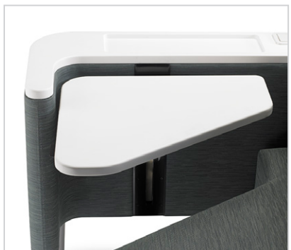
Flop Sofa adjustable table